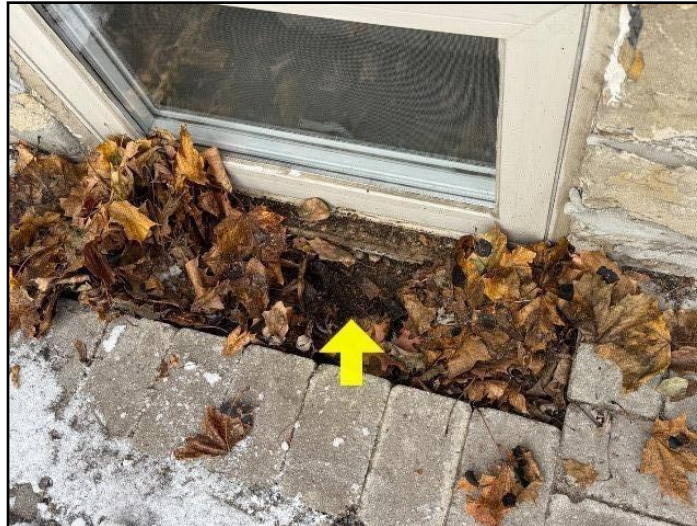
4. Rear window well