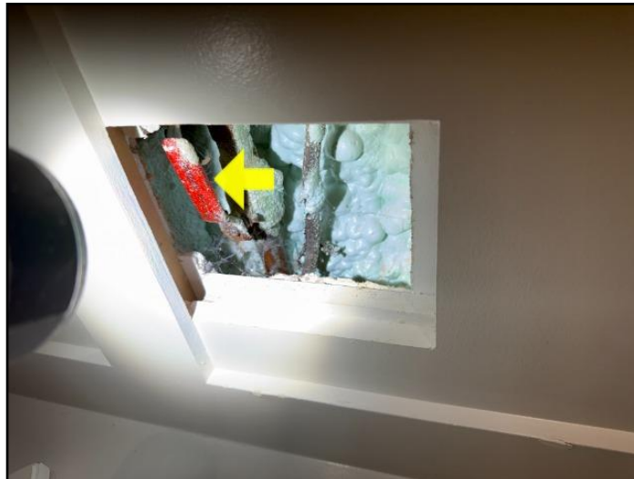
8. Main water shut off valve - Front of the...