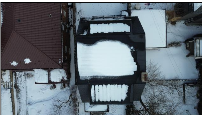
1. Roof view

• Portions of the roof covering were snow/ice covered at the time of inspection, limiting full evaluation. Visible areas were inspected from the ground and or by drone where accessible.