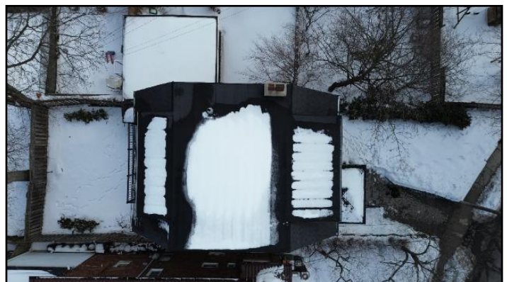
2. Roof view