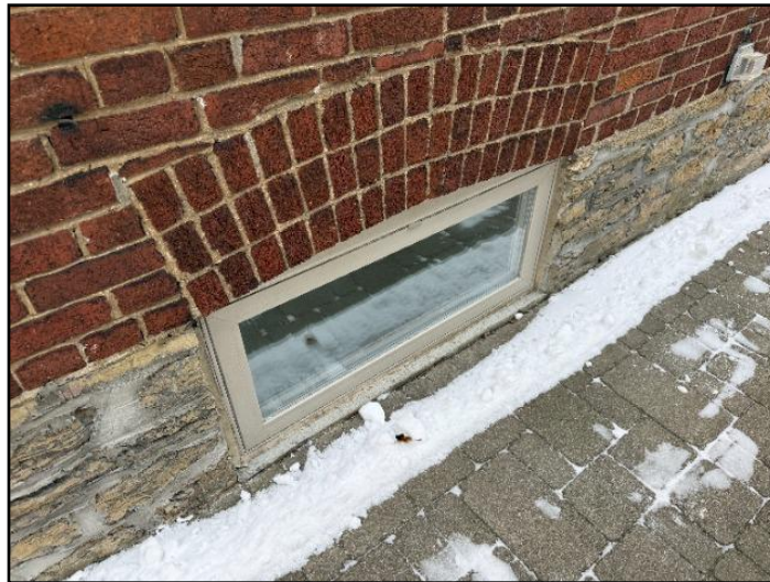
3. Sill - Near or at Grade Level

Cost: If/when upgrading to window wells in the future, $2000 and up each